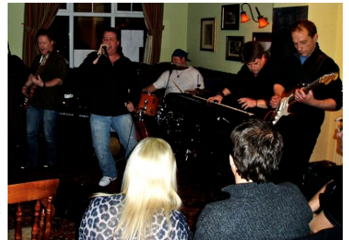
Strange Kind of Purple

If you want a showcase slot then contact Mark Venus at mark.t.venus@btinternet.com