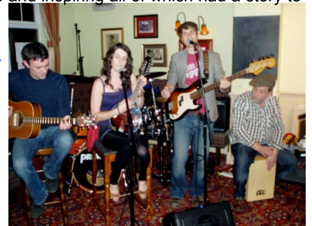
The Penny Red

In complete contrast to The Penny Red and indeed anyone else who had previously appeared we were treated to a tribute band in the shape and form of Strange Kind of Purple yes you got it they were a tribute act to Deep Purple. Well I have seen Deep Purple perform on many occasions and this band really did do justice to their songs, playing all the favourites and they immediately had the audience with them. But it was the lead singer who stole it for me his voice has to be heard to be believed and he could easily rub shoulders with the greatest rock singers you care to think about.